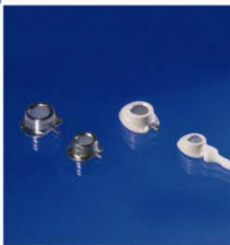
4 sizes of implantable ports.