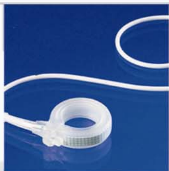
X-rays detectable ring and catheter.